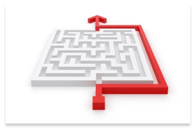
EASE OF USE